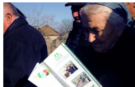
Europe and the Caucasus