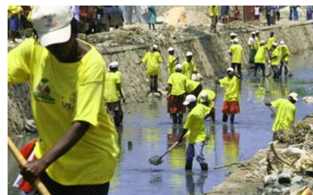
Latin America and the Caribbean